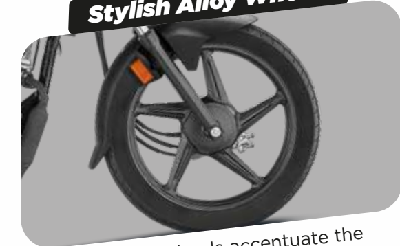
Stylish Alloy Wheels All-black alloy wheels accentuate the overall look of the bike.